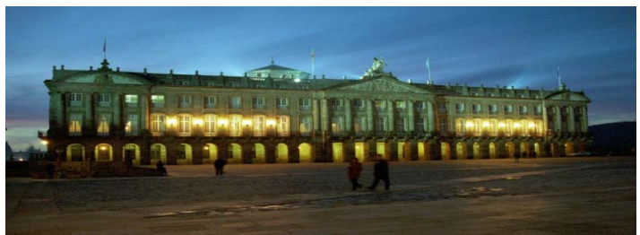
Consello da Cultura Galega