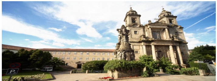
Hotel San Francisco